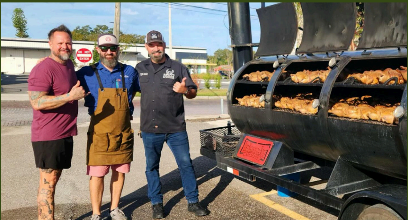
Preparing Thanksgiving meals for hundreds of local veterans.

This event honors the service and sacrifice of military veterans while bringing the community together for a day of fun, entertainment and camaraderie. Proceeds from the Veterans Day Block Party will benefit Signature for Soldiers' Thanksgiving Day Celebration that provides over 200 meals to local veterans annually.